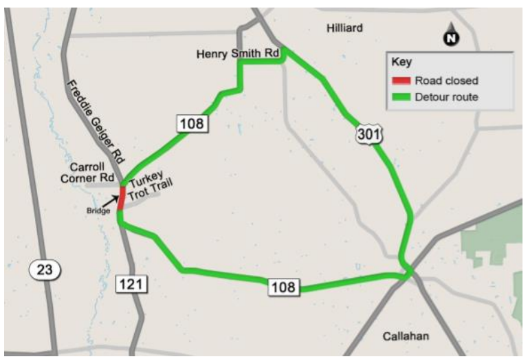
Detour map of Nassau County bridge repair (work performed by FDOT)

The Florida Department of Transportation is scheduled to temporarily close a portion of County Road 121/Baldwin and Saint George Road between Turkey Trot Trail and Carroll Corner Road in mid-July 2019. The closure will be in place until rehabilitation work is completed on a bridge culvert damaged from erosion. Northbound and southbound drivers on County Road 121 will detour to U.S. 301 via County Road 108 and Henry Smith Road. More information about this project can be found by visiting <a href="https://www.NFLRoads.com">www.NFLRoads.com</a>.